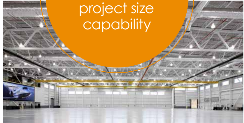
BOOM Supersonic Greensboro, NC