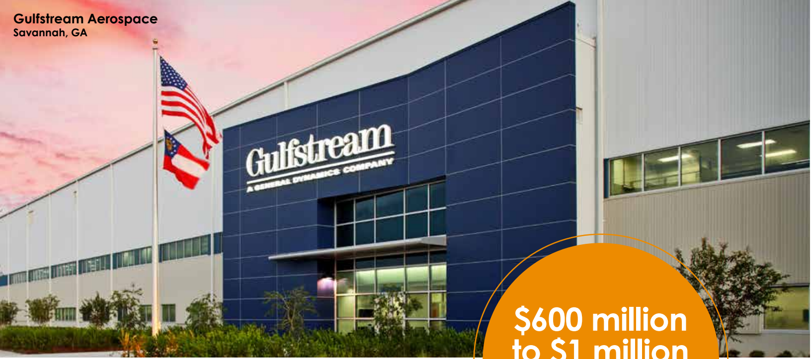
Gulfstream Aerospace Savannah, GA

$600 million to $1 million project size capability