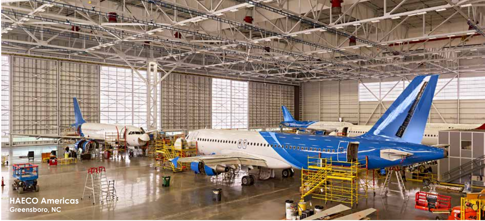
HAECO Americas Greensboro, NC