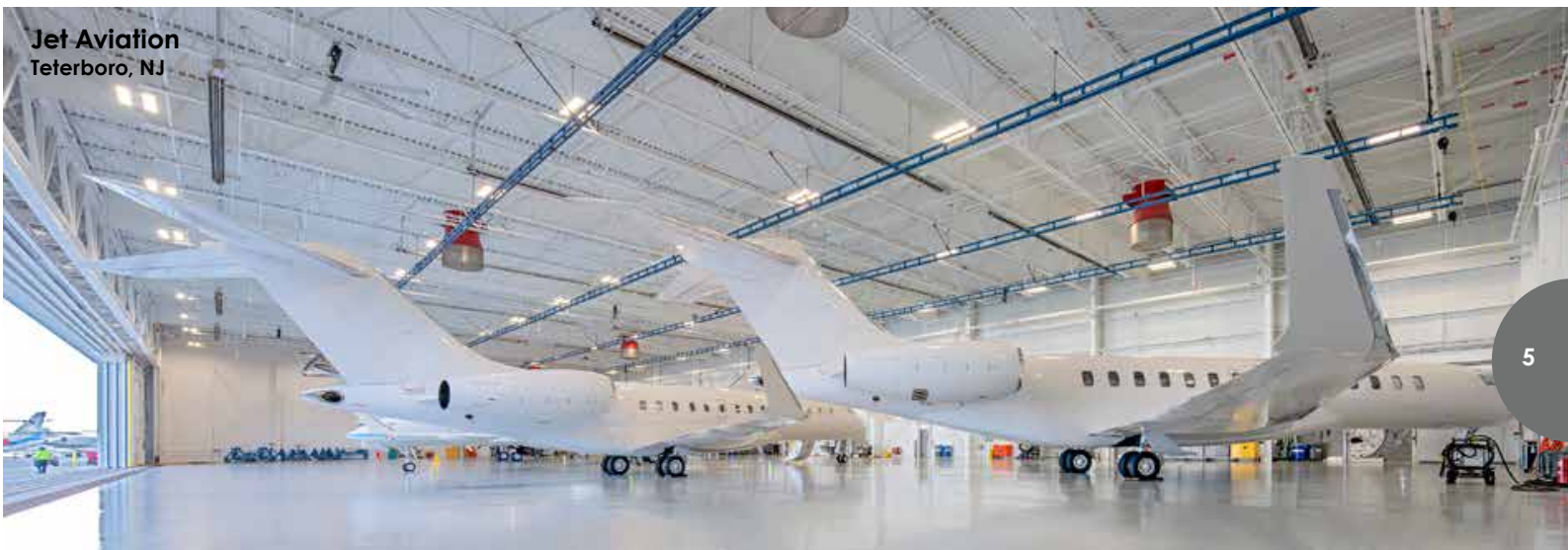
Jet Aviation Teterboro, NJ