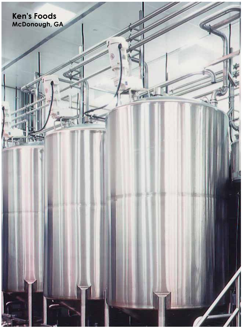
Ken's Foods McDonough, GA