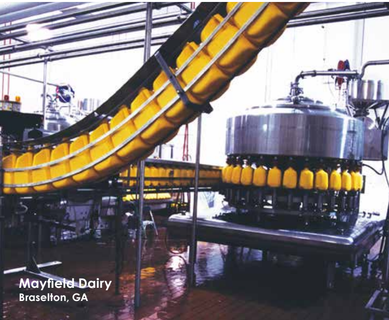
Mayfield Dairy Braselton, GA