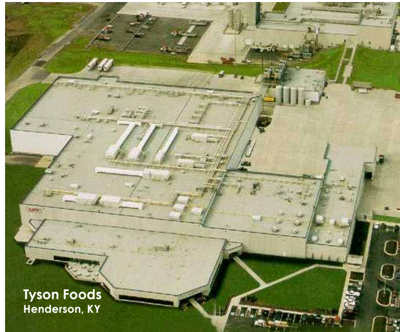
Tyson Foods Henderson, KY