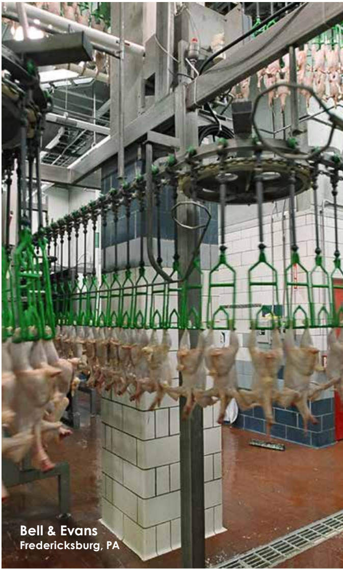
Bell & Evans Fredericksburg, PA