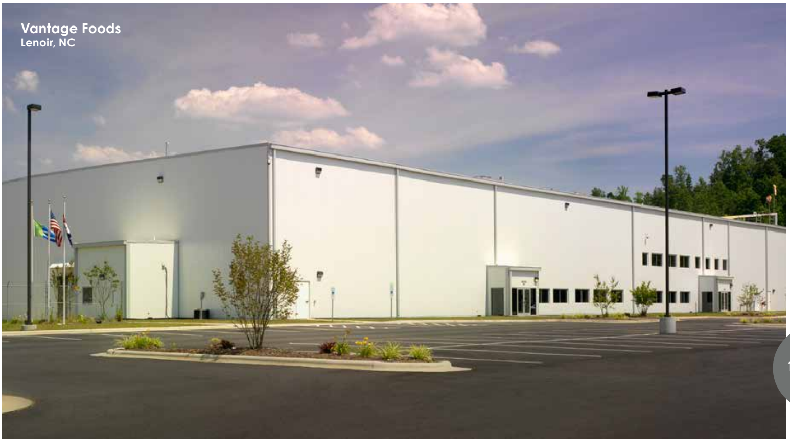
Vantage Foods Lenoir, NC