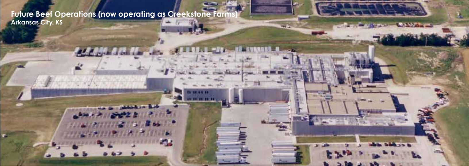
Future Beef Operations (now operating as Creekstone Farms) Arkansas City, KS