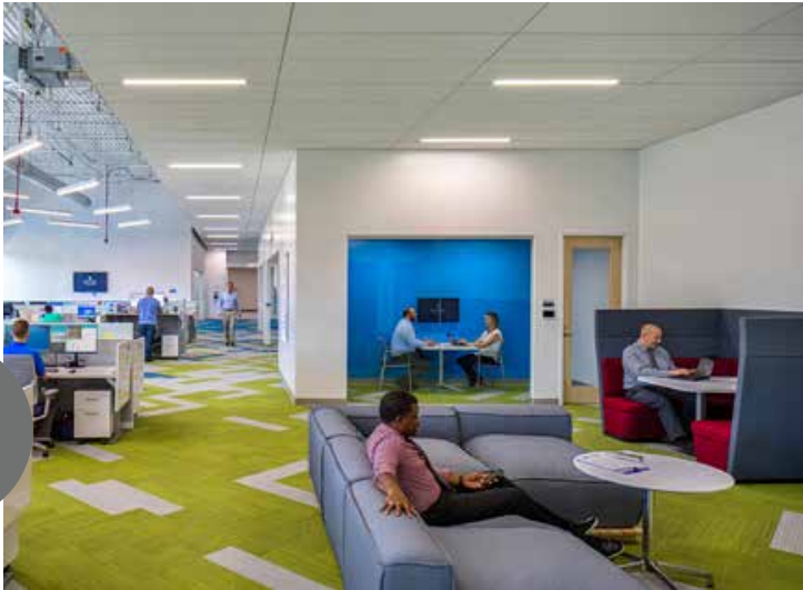
Confidential Client Biomanufacturing Facility Durham, NC