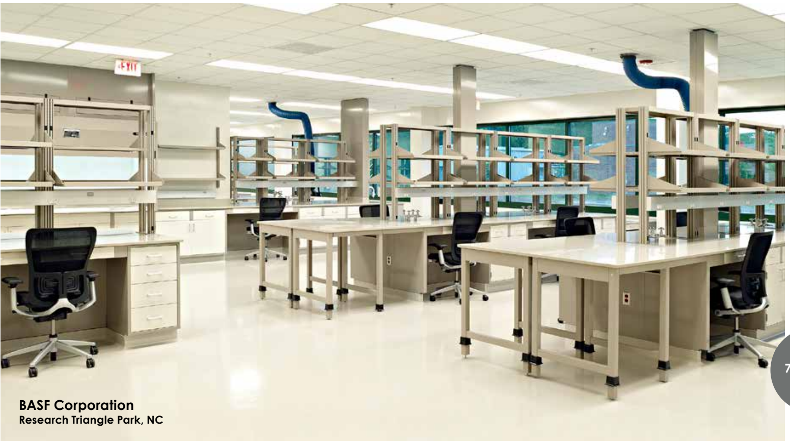
BASF Corporation Research Triangle Park, NC