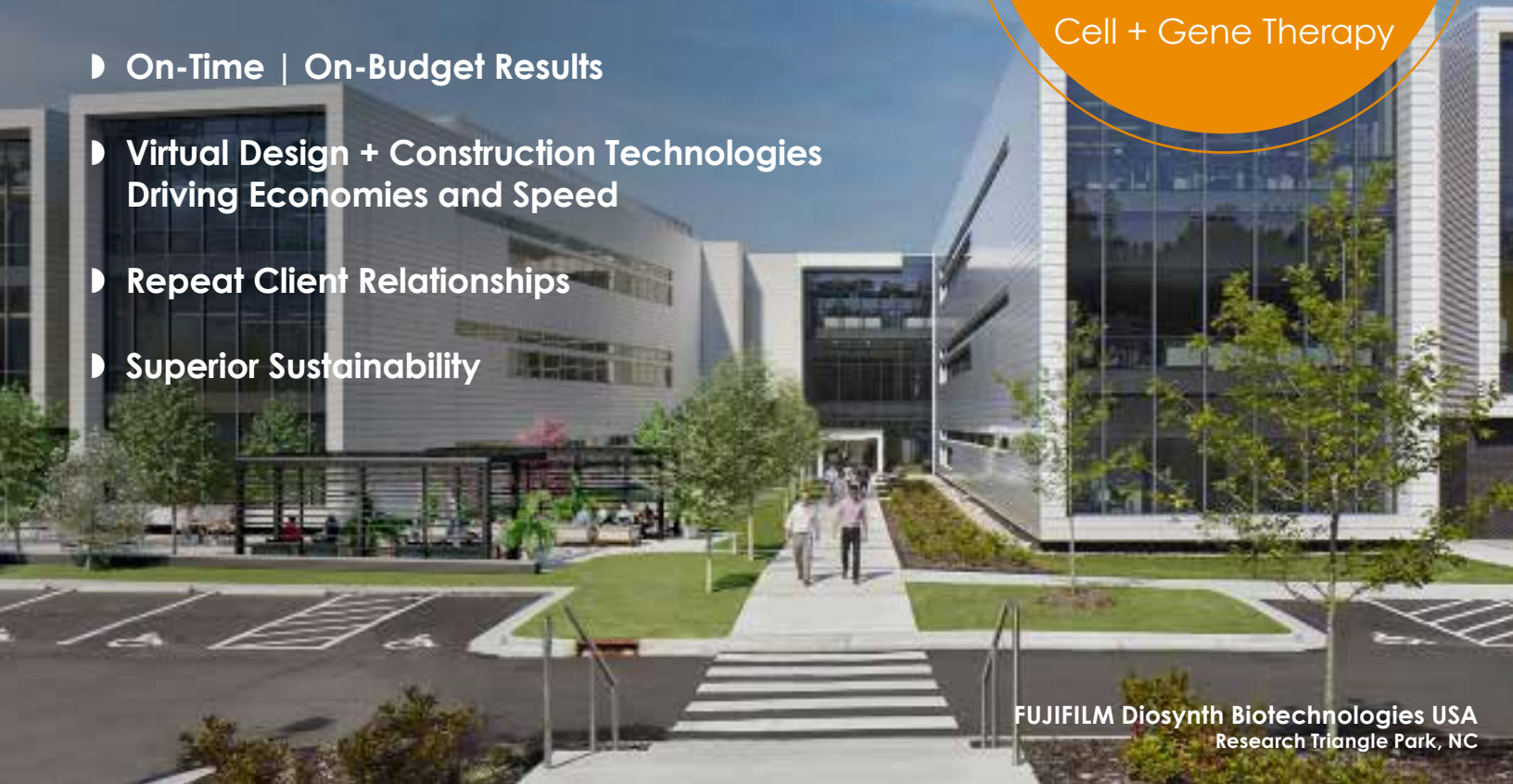
FUJIFILM Diosynth Biotechnologies USA Research Triangle Park, NC

$3 billion in projects for Life Sciences clients, including Biotech, Pharma, and Cell + Gene Therapy