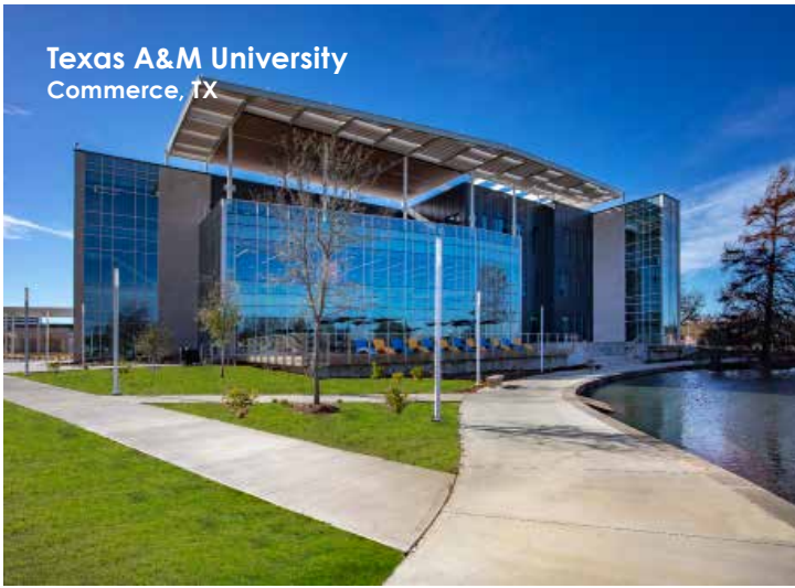
Texas A&M University Commerce, TX