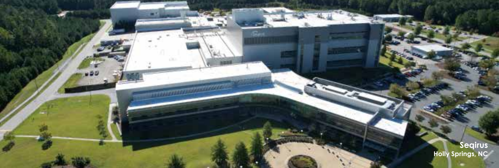
Seqirus Holly Springs, NC