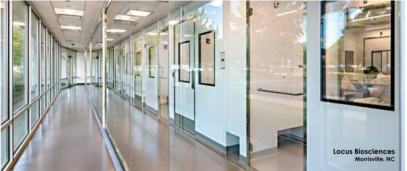
Locus Biosciences Morrisville, NC