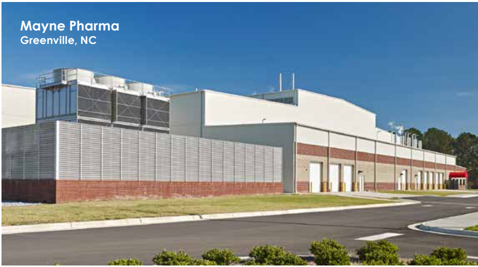
Mayne Pharma Greenville, NC